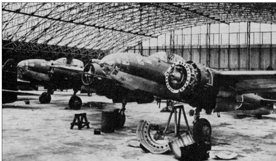
ASV-radar equipped Gingas abandoned in a hangar at the end of World War II.