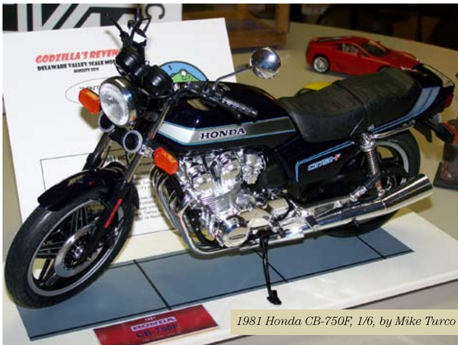
1981 Honda CB-750F, 1/6, by Mike Turco