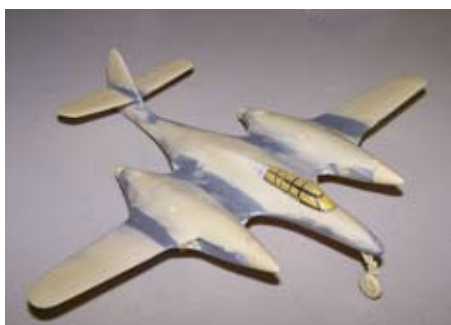
McDonnell XP-67 "Moonbat" (in-progress), 1/72, by Howard Rifkin