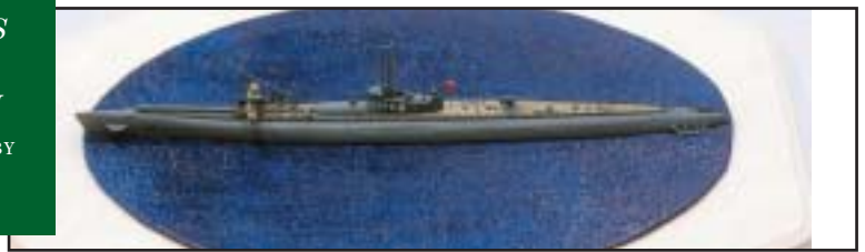
Four of Bob Cicconi's fine ships were award winners at the IPMS Nat'l Convention. Clockwise from left; 1/125 U-99, 1/700 HMS Leviathan, 1/700 USS Hughes, and 1/700 IJN I-54