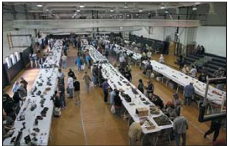
The show floor at NNL East. The Wayne PAL is offers plenty of for the show, and is also the home of MosquitoCon.