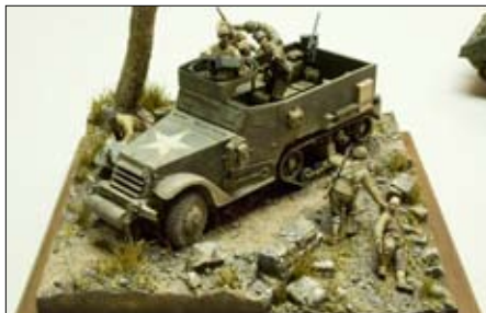
Unlabeled half-track diorama