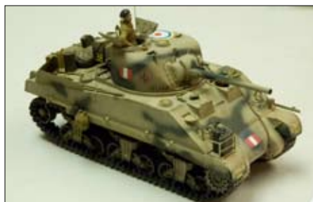
Lou Ursino; British Sherman, 1/35