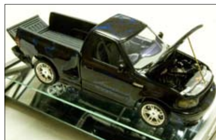
Nick Sandone; Ford F-150 "Lightning," 1/25