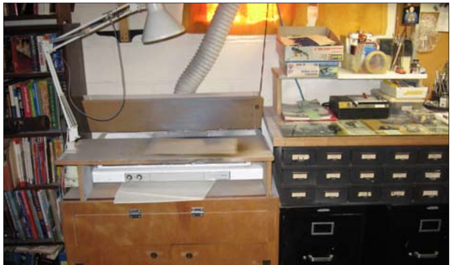
Joe's spray booth is made from a kitchen range hood turned upside down to pull dust and fumes down and away from the work. Cabinet below provides additional storage.

part of the cabinet front by cutting the area above the cabinet doors and attaching them with hinges so it opens upward.