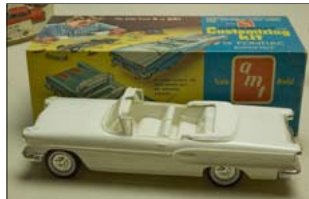
Lou Isern; 1958 Pontiac Bonneville, 1/25