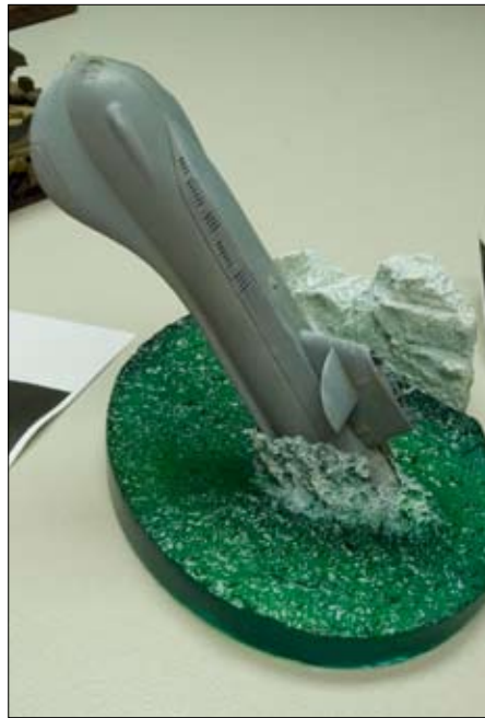
Dan Golembiewski; Breeching Seaview resin base casting