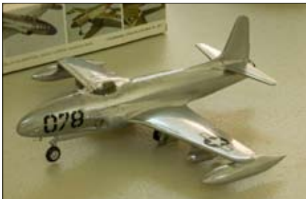
Doug Goerke; F-80 Shooting Star, 1/72