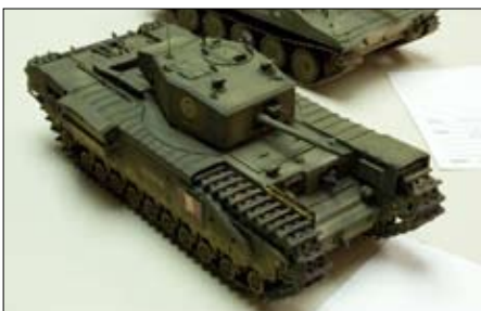
Lou Ursino; Churchill Mk-III, 1/35