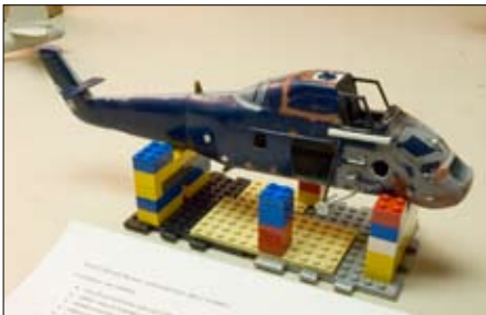
Joe Vatillana; Westland Wessex HAS-3 to HAR-2 Conversion, in-prog., 1/48