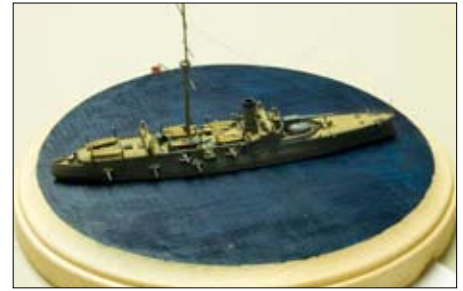
Bob Cicconi; Itsukushima, 1/700