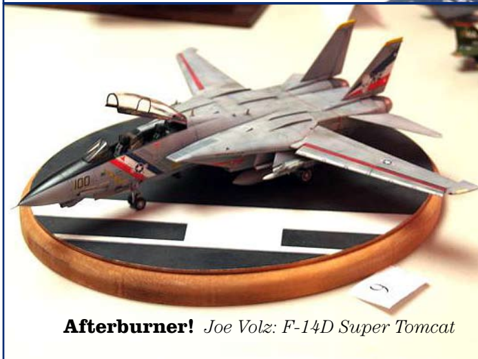
Afterburner! Joe Volz: F-14D Super Tomcat