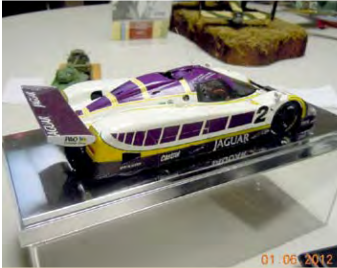
Jaguar XJR-9, 1/24, by Lou Ursino