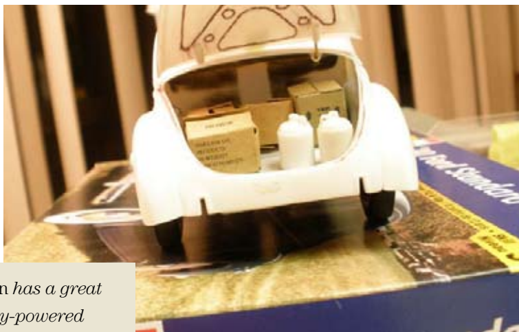
Tommy Kortman has a great start on a Caddy-powered '40 Ford moonshine runner, complete with a trunkload of likker

Birds of a feather! Joe Volz: F-15N "Sea Eagle," w/US Navy markings, clipped wings, added wing tip launch rails and additional underwing & fuselage missile stations, F-14 Tomcat landing gear, added arrestor hook, conformal fuel tanks for additional range, added F-14 chin pod, resin ACES II ejection seats. 1/72 Revell F-22A Raptor, w/ Paula resin seat, scratchbuilt HUD, Two Bobs decals. 1/72 Accurate Miniatures MQ-1 Predator UAV, OOB. Joe Leonetti: T-bolt Air Racer (P-47 airframe). Joe Vattilana 1/72 Pegasus Vought F5U-2 "AWACS Flapjack" (experimental pancake-shaped Navy fighter), w/ modified landing gear, radar disk & supports from Fujimi Grumman E-2 Hawkeye, scratch-built engine nacelles, cockpit nacelle from Grumman Avenger conversion kit. Doug Goerke: 1/32 Unimax